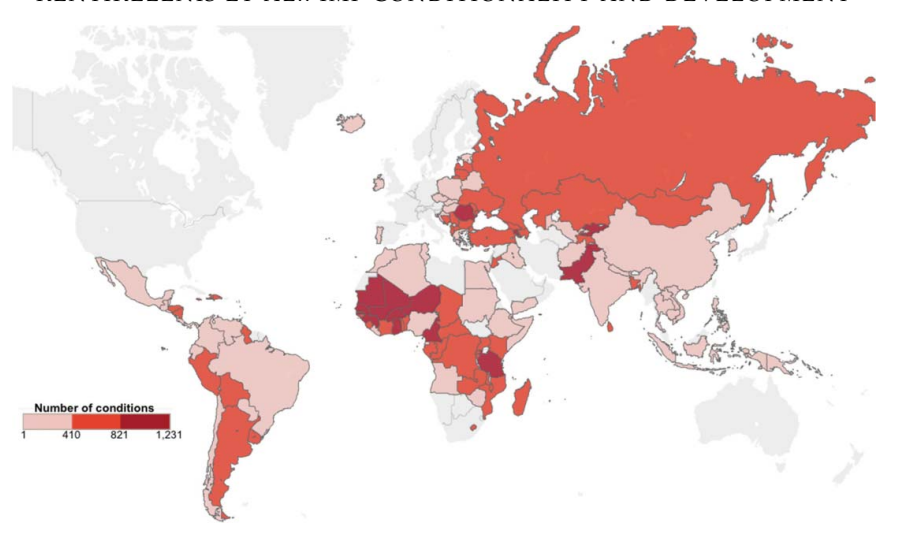
Figure 1 Total conditions, 1985–2014.

30 years covered, carrying a total of 1,058 conditions. Other countries had only brief encounters with the Fund, which is also reflected in relatively limited conditionality. For instance, China only had a one-year Stand-by Arrangement - the IMF's staple lending facility - with 28 conditions attached between 1986-87.